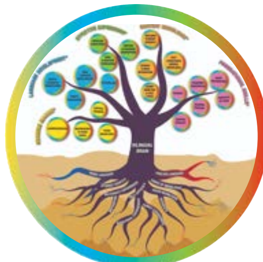
©2024 California Association for Bilingual Education. All rights reserved.

Literacy development is a complex process, and current conversations and research summaries aren't always inclusive or representative of the unique needs of our multilingual learners and programs. CABE's comprehensive model of Critical Literacy/Biliteracy for Multilingual Learners is based on specific biliteracy research, and this session will highlight skills, components, and instructional practices that ensure achievement for multilingual learners. Come explore this dynamic, teacher-driven model!