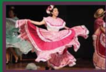
North Monterey County USD Student Entertainment