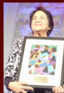
Dolores Huerta at CABE 2018

I want students to get a sense of their own empowerment and the things they can do to make the world a better place. I'm hoping that Dolores Huerta Day will be focused on civic engagement. —Dolores Huerta