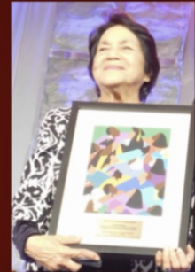
Dolores Huerta at CABE 2018

I want students to get a sense of their own empowerment and the things they can do to make the world a better place. I'm hoping that Dolores Huerta Day will be focused on civic engagement. —Dolores Huerta