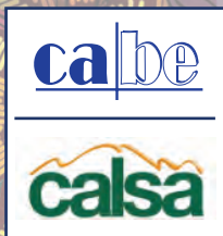
Superintendent Panel: CABE & CALSA Leaders